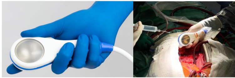
Fig. 2 Cardiac shockwave applicator

which has been used in the prior safety and feasibility study. The shockwave frequency is set to 4 Hz. CSP has direct contact with the epicardium via the sterile cover using sterile ultrasound gel in the cover.